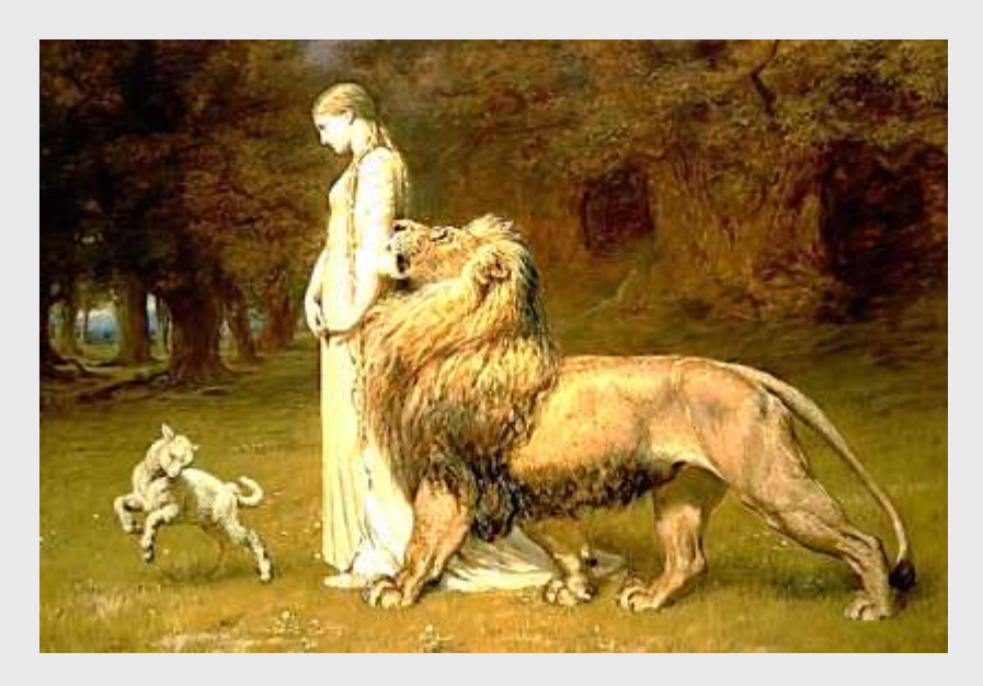
Greetings in the Name of our LORD!